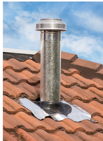
Example of finished product on tile roof